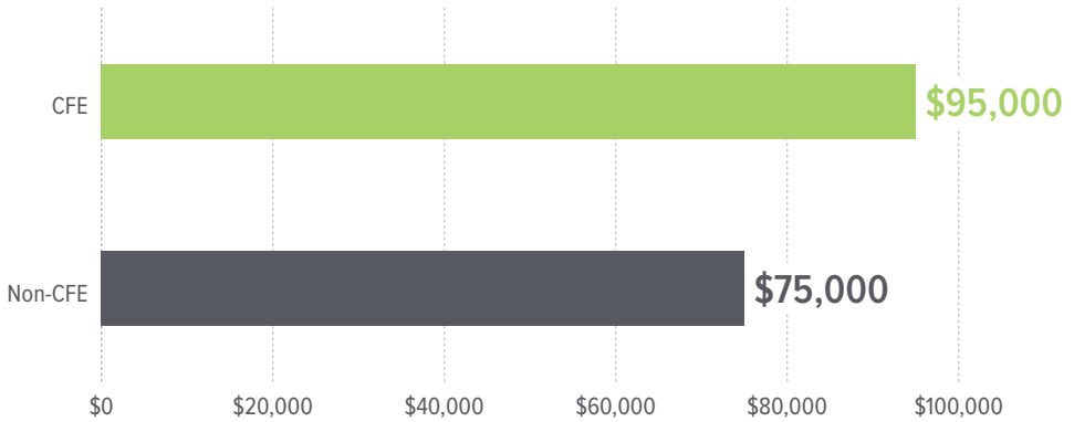
Median Total Compensation for CFE and Non-CFE Accounting Professionals

There is a CFE premium of 27% for accounting professionals.